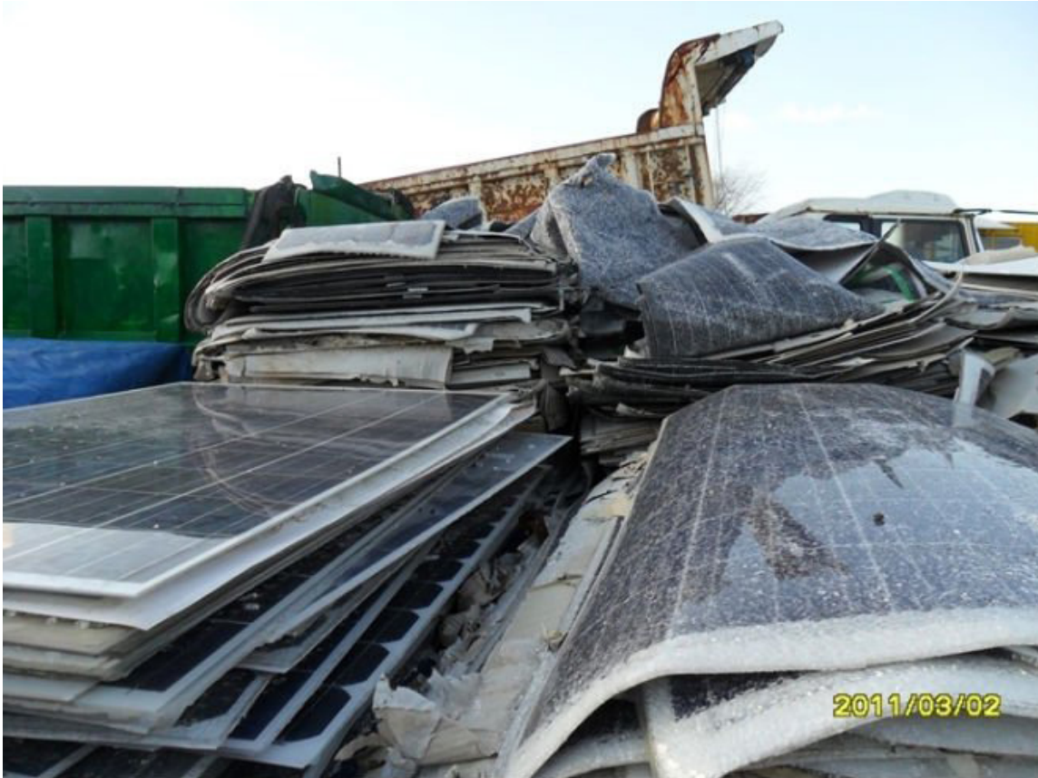
Figure 4: The mangled PV panels in this picture illustrate the nature of broken solar panels; the glass cracks but the panel is still in one piece.

PV panels constructed with the same basic components as modern panels have been installed across the globe for well over thirty years. 3 The long-term durability and performance demonstrated over these decades, as well as the results of accelerated lifetime testing, helped lead to an industry standard 25-year power production warranty for PV panels. These power warranties warrant a PV panel to produce at least 80% of their original nameplate production after 25 years of use. A recent SolarCity and DNV GL study reported that today's quality PV panels should be expected to reliably and efficiently produce power for thirty-five years. 4